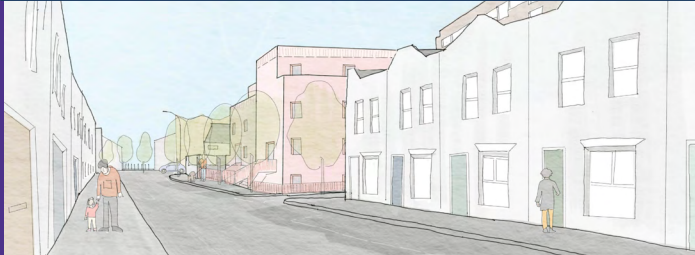
View of proposed new homes looking at junction of Hadley Street and Lewis Street

Thank you to everyone who came to our November 2024 developing design ideas event where we collected your feedback on the latest proposals.