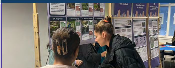
Residents seeing developing designs Nov 2024

Since we last met with residents in November 2024, the team has been refining the proposed designs.